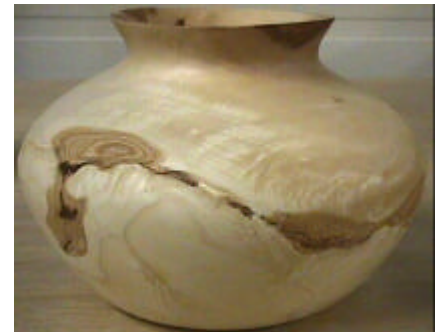
Work in progress –turned wet & left on lathe for 2 hrs @ 1000rpm & sanded By George Turton