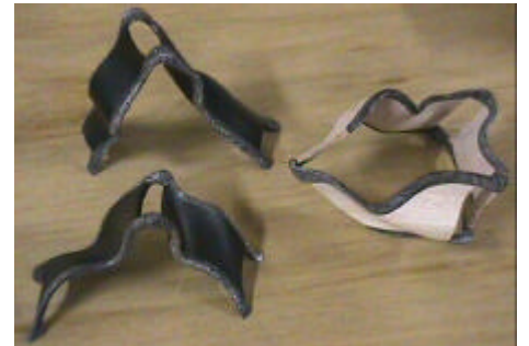
Walnut dyed turned piece cut into sections By Marilyn Campbell