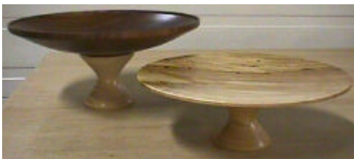
Left to right- Walnut & spalted maple base, Maple & spalted Maple by Jim ODell