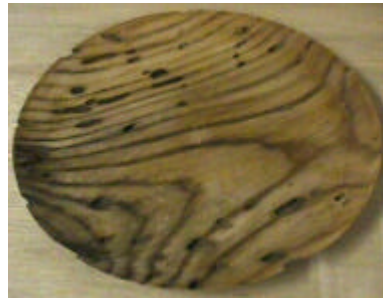
Ash plate with carpenter ant holes by Ron Stewart