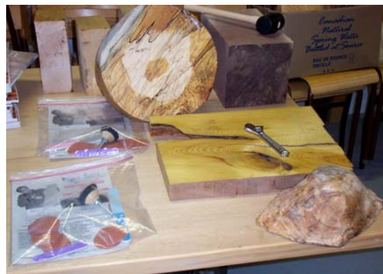
Club Draw Donations