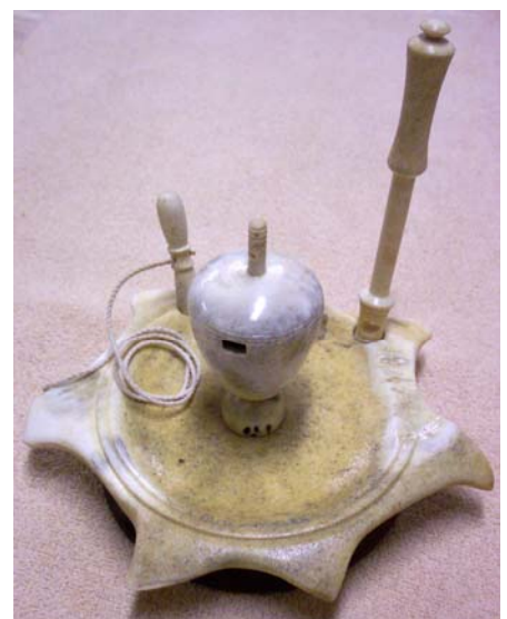
Art DeBoo – Moose Antler Whistling Top