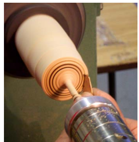
Art DeBoo – Burning in rings using a piece of veneer