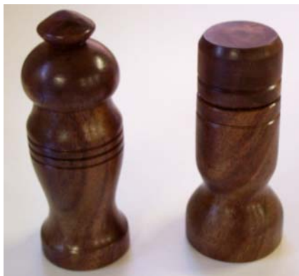
Ken Perrott – Walnut Toothpick holders