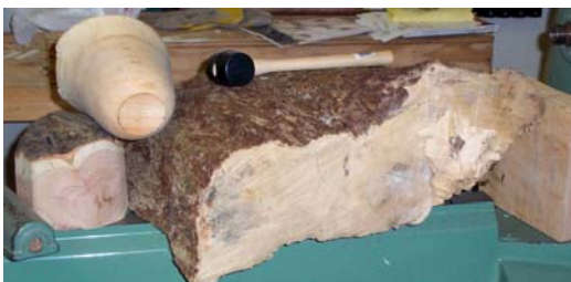
Club Draw Donations