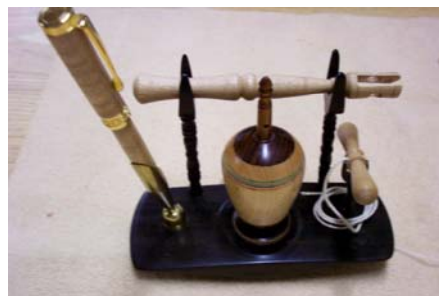
Art DeBoo – Ebony, Birdseye Maple, & Kingwood Executive Whistling Top Set