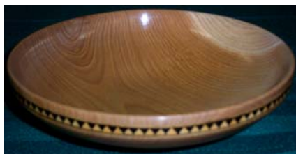
Ken Perrott - Ash with banding