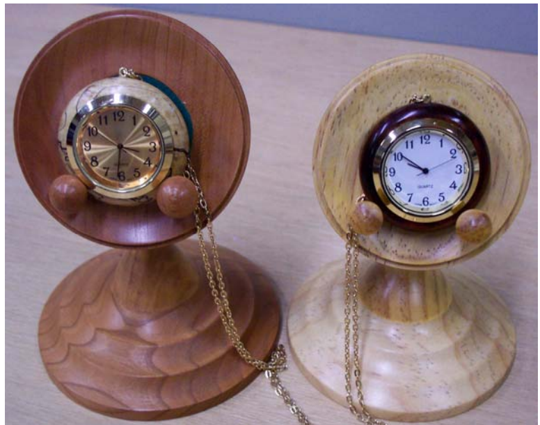
Bob Hastings Watches & George Turton Pocket Watch Stands