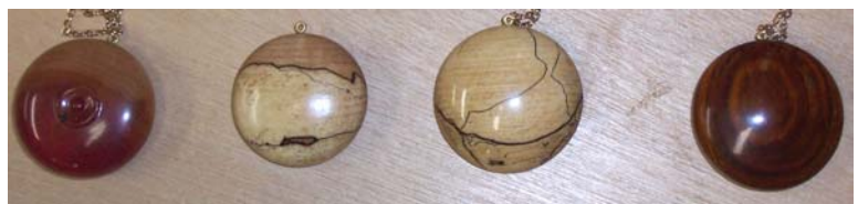
Bob Hastings Watches – showing the front & back