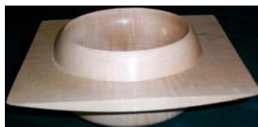
Dave Plowright - Maple