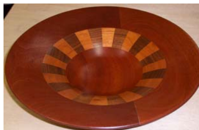
Ken Perrott - Mahogany, cherry & walnut