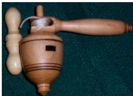
Bill Van Osch - Arbutus Whistling Top