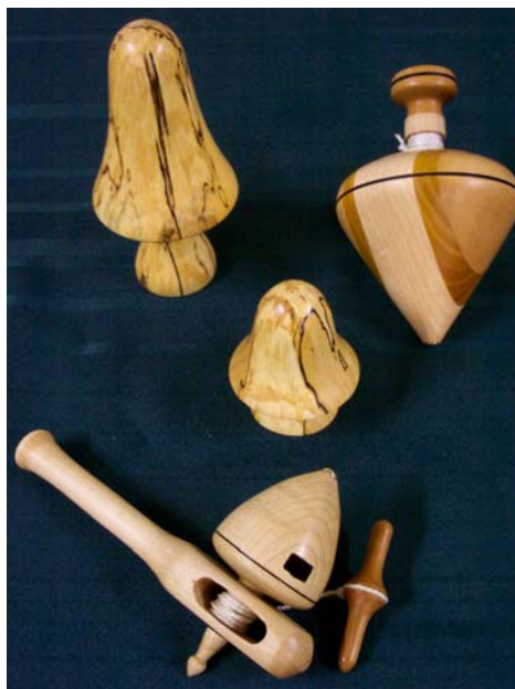
George Turton - Spalted beech Mushrooms, Sage Orange Top & Maple Whistling Top