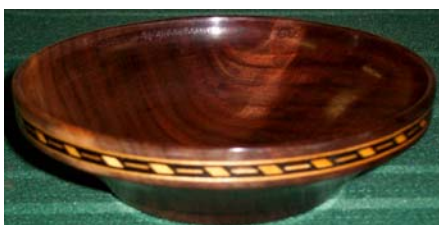
Ken Perrott - Walnut with banding