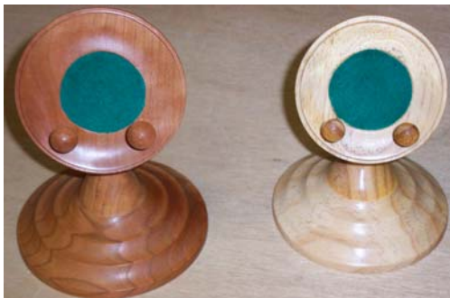
George Turton- Pocket Watch Stands