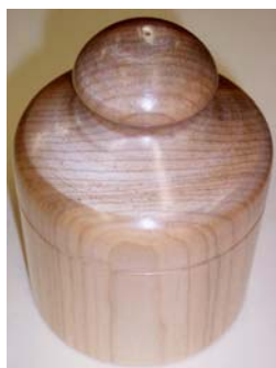
Soft maple lidded box - Ken Perrott