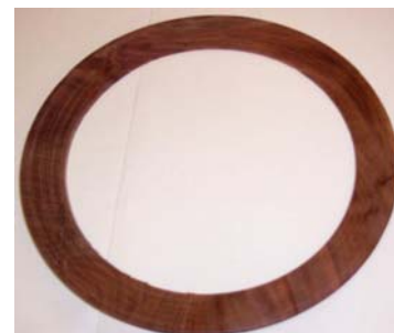
Turning mistake - the lip that became a frisbee