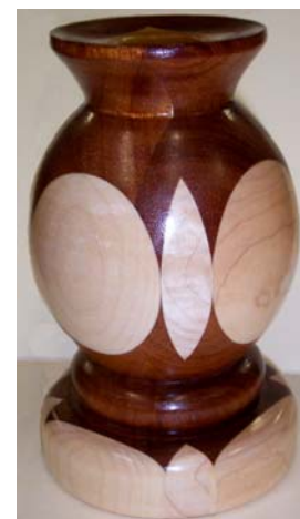
Hard maple & mahogany -Ken Perrott