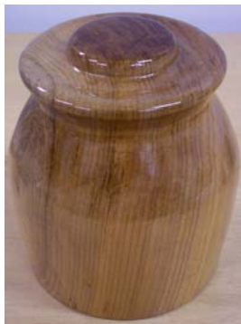
Butternut cremation urn –Ivan Franklin