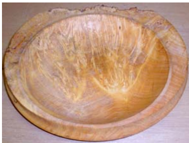
Box elder burl turned on two centres –Ivan Franklin