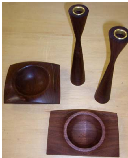
Black walnut candlesticks & square bowls with epoxy & brass powder – Dave Plowright