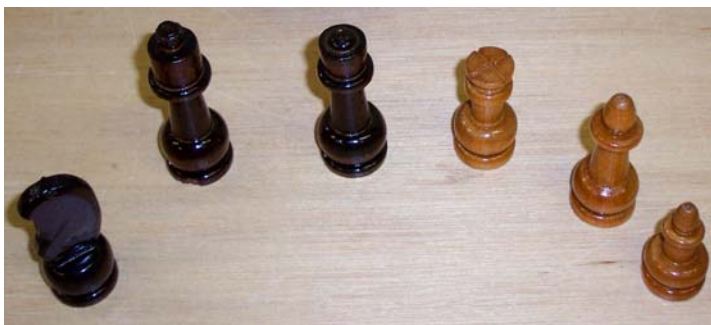
Hard maple chess pieces-first pieces turned by Ken Perrott more than 62 years ago at age 14