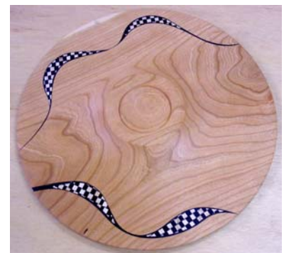
Front side of turning with epoxy – Marilyn Campbell