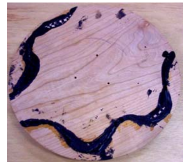
Back side of turning with epoxy –Marilyn Campbell