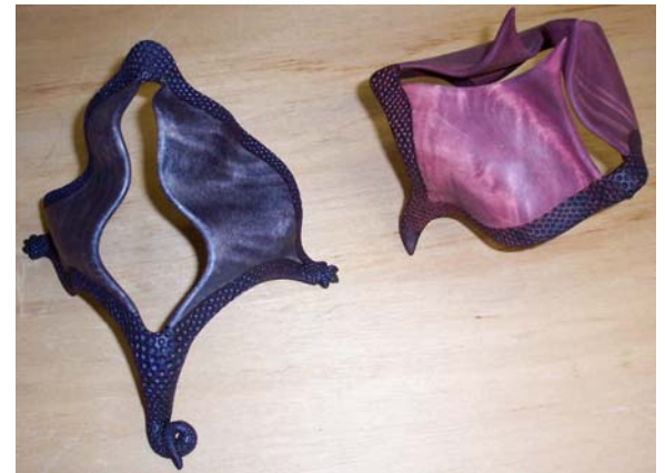
Marilyn Campbell – Curly Maple turned, cut, epoxy applied and re-formed into unique pieces