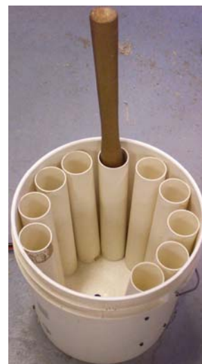
John Calver's Portable tool bucket