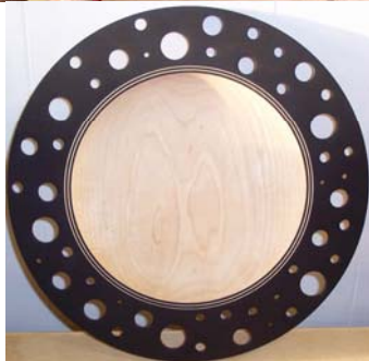
John Calver's setup for decorative routing and sample of finished platter