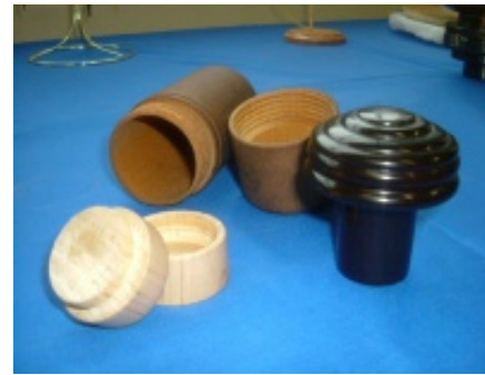
Threaded Boxes with lids