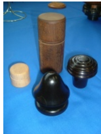
Boxes & Puzzles