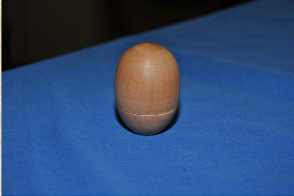
GREY BRUCE WOODTURNERS GUILD