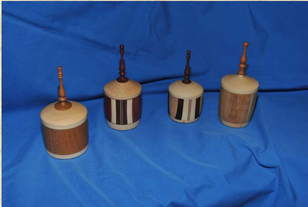
GREY Lidded boxes by Carl Durance.