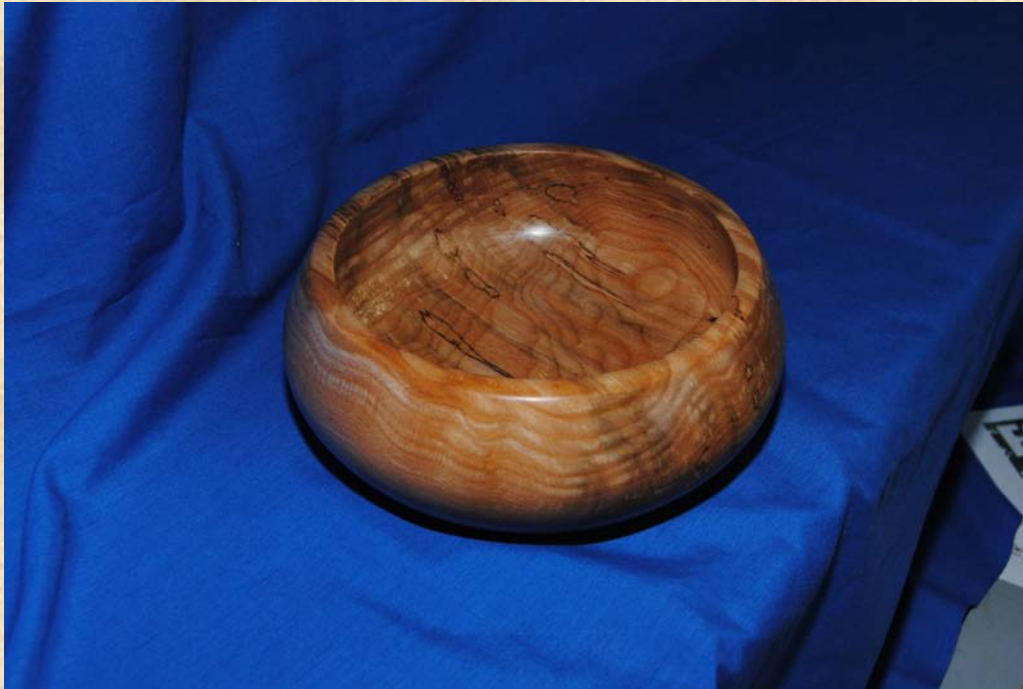
Spalted Birch Bowl – Don Turcotte