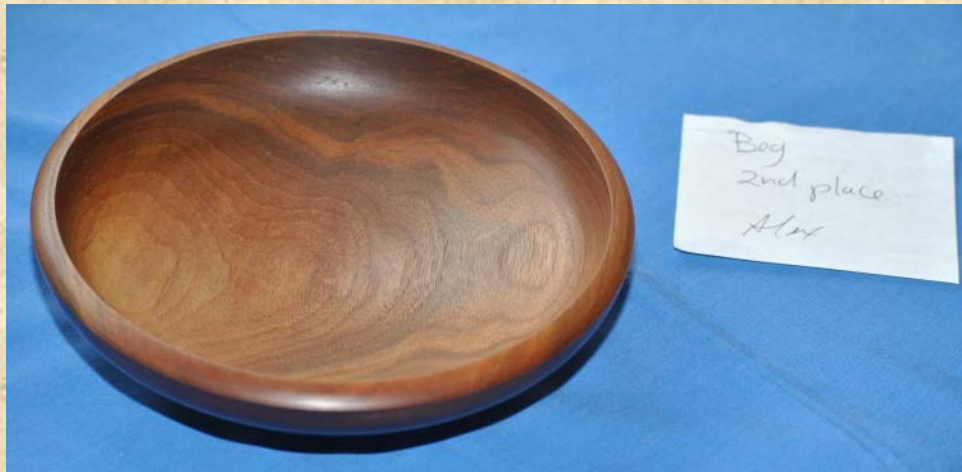
2 nd Place – Alex Ewing