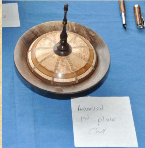
1 st Place - Carl Durance