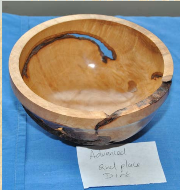
2 nd Place – Dirk Hoogendoorn