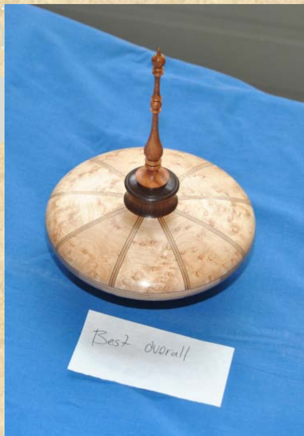
Best Overall – Carl Durance