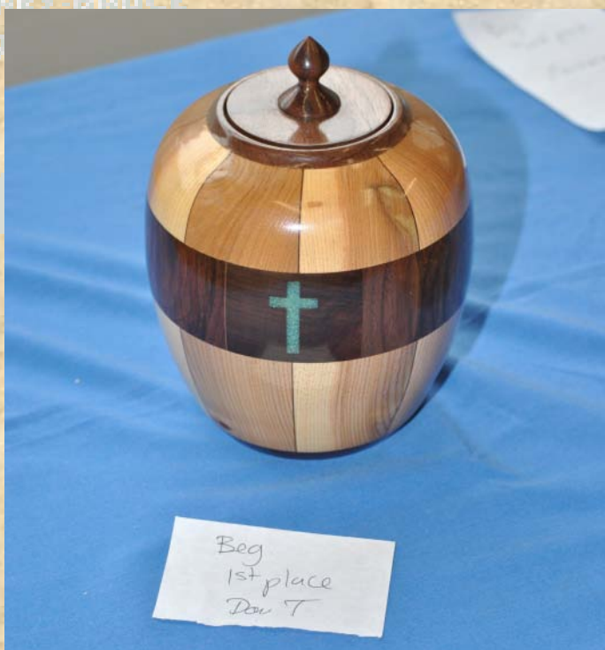
1 st Place – Don Turcotte