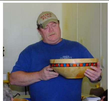
Bowl with an inlay of old pen blanks around the edge.