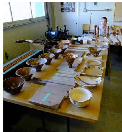
2 tables of samples brought for the presentation.