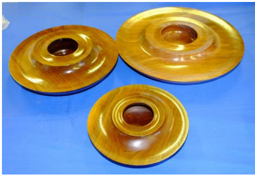
Some interesting "flying saucer" type bowls/platters from Ray Fenton.