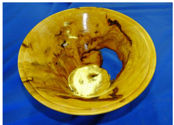
Dirk not sure where all the wood went. Nice piece of spalted maple.