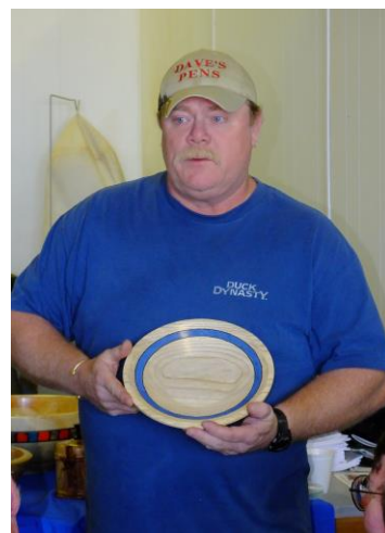
Plate with a blue milk paint ring, from Dave Bell.