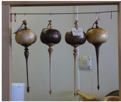
Some hollow form ornaments from Carl.