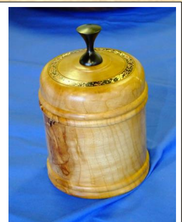
Spalted maple box from Bob Dyck, with Cu embedded into epoxy on lid for decoration.