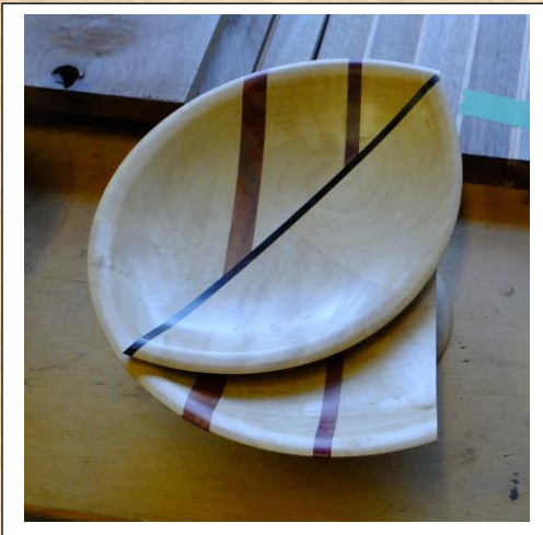
Ray's attempt at abstract art, a sure "Instant Gallery" winner ! (Also an example of how NOT to glue end grain for a strong joint).